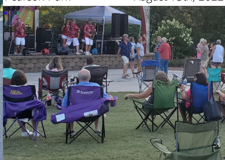
August 13th, 2022